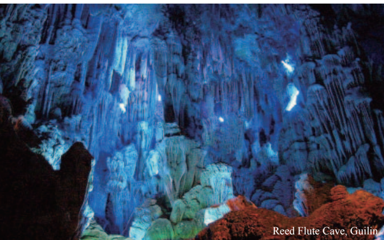
Reed Flute Cave, Guilin