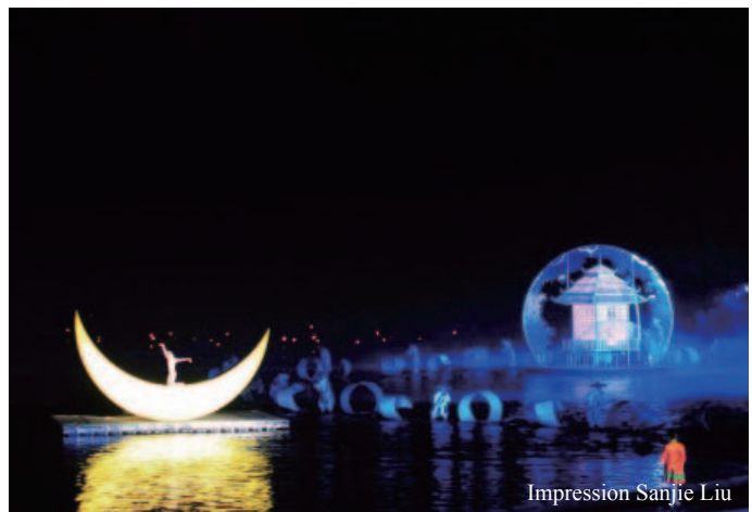
Impression Sanjie Liu